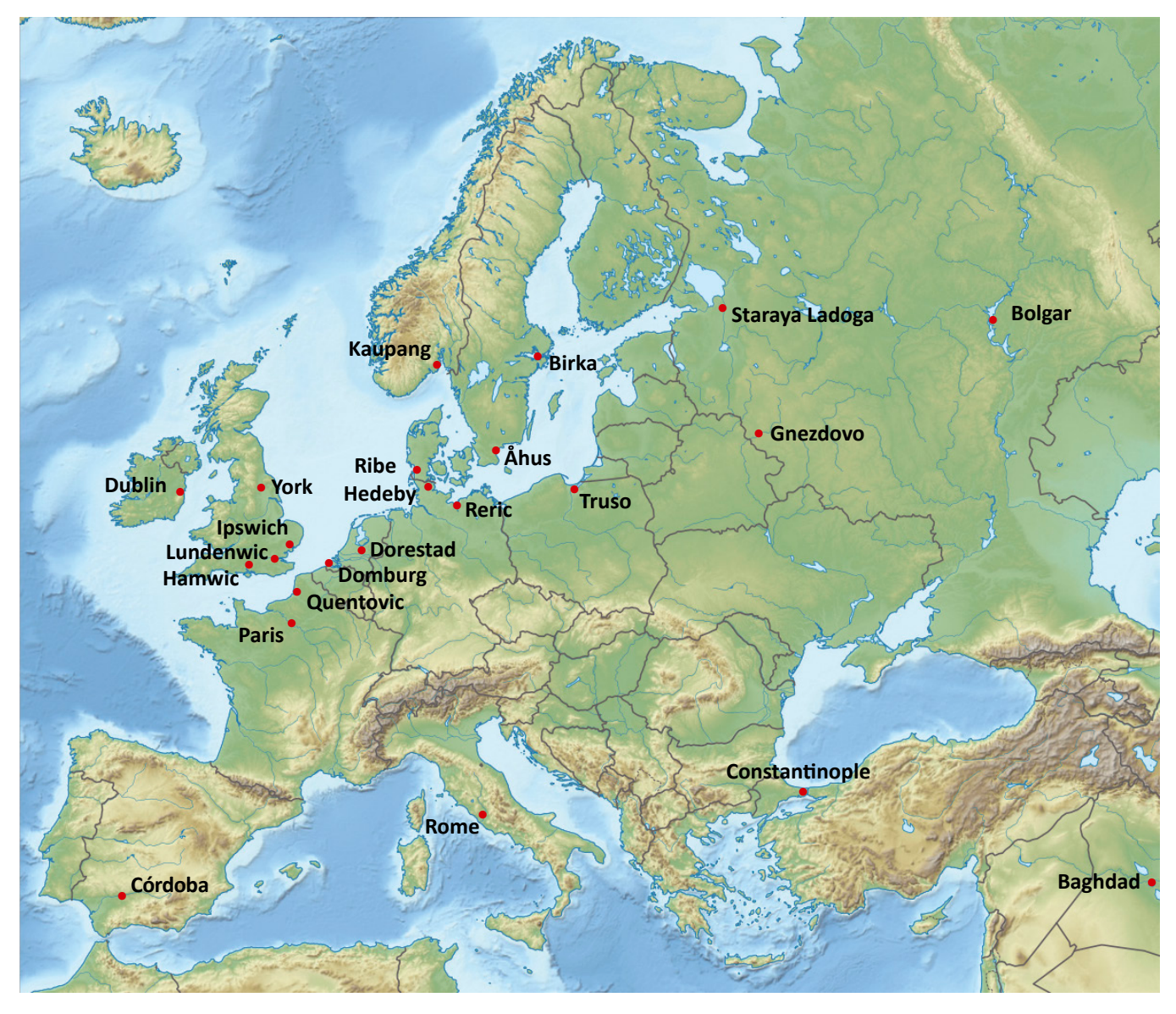
Figure. 1.1. Map of Northern Europe with sites mentioned in the text.

products were procured, such as furs, iron, tar, or hones (Stene & Wangen 2017). These changes were never so intense outside the emporia, however. In terms of economy and social fabric, these could easily be taken for urban societies. And yet they were small and widely scattered, and thus far 'odd' in terms of what archaeologists consider typical towns and cities (Sindbæk 2022).